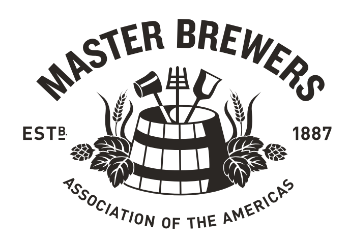
One color- Black, no outside plaque