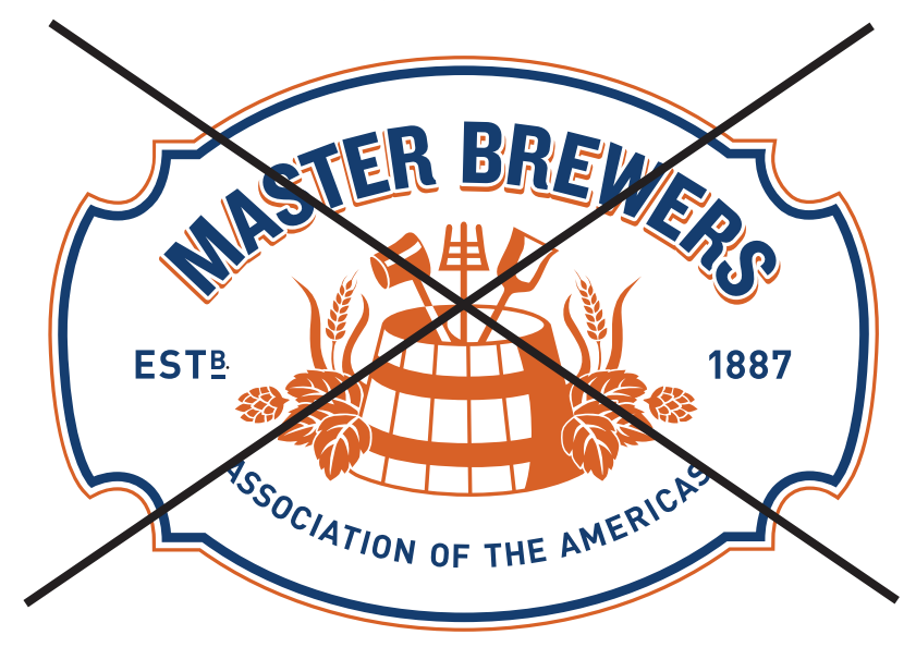
Do NOT change the logo coloration. The only permissable colors are PMS Black, PMS 117 or white.