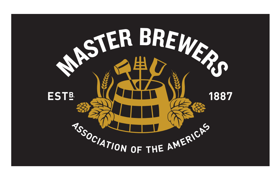
Logomark reversed in 2 color, no outside plaque