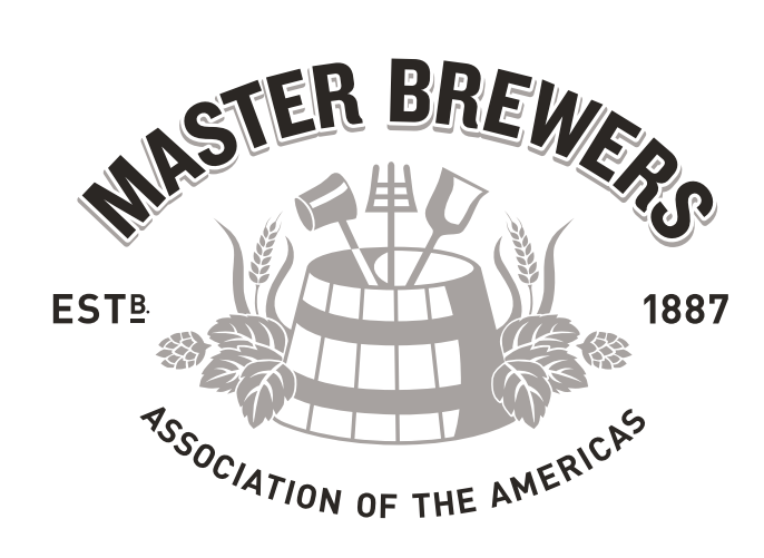
Logomark in grayscale, no outside plaque