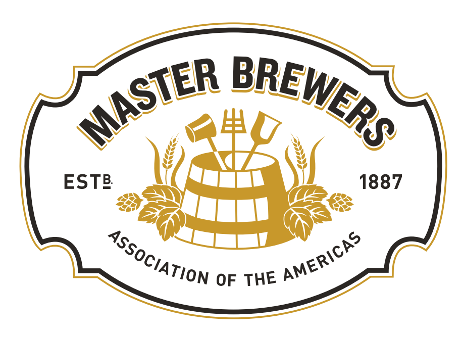
Preferred Master Brewers Logomark