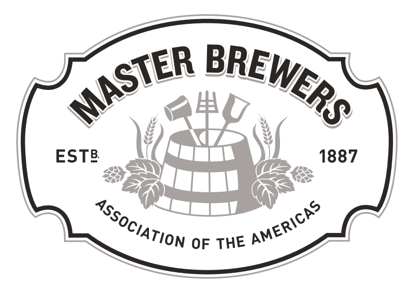
Logomark in grayscale