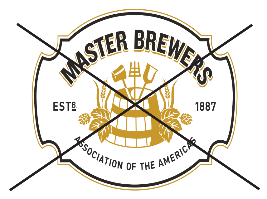
Never vertically stretch the logomark