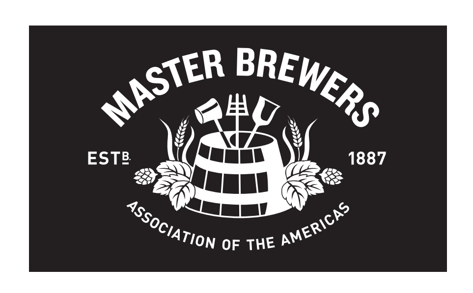
Logomark reversed in white, no outside plaque