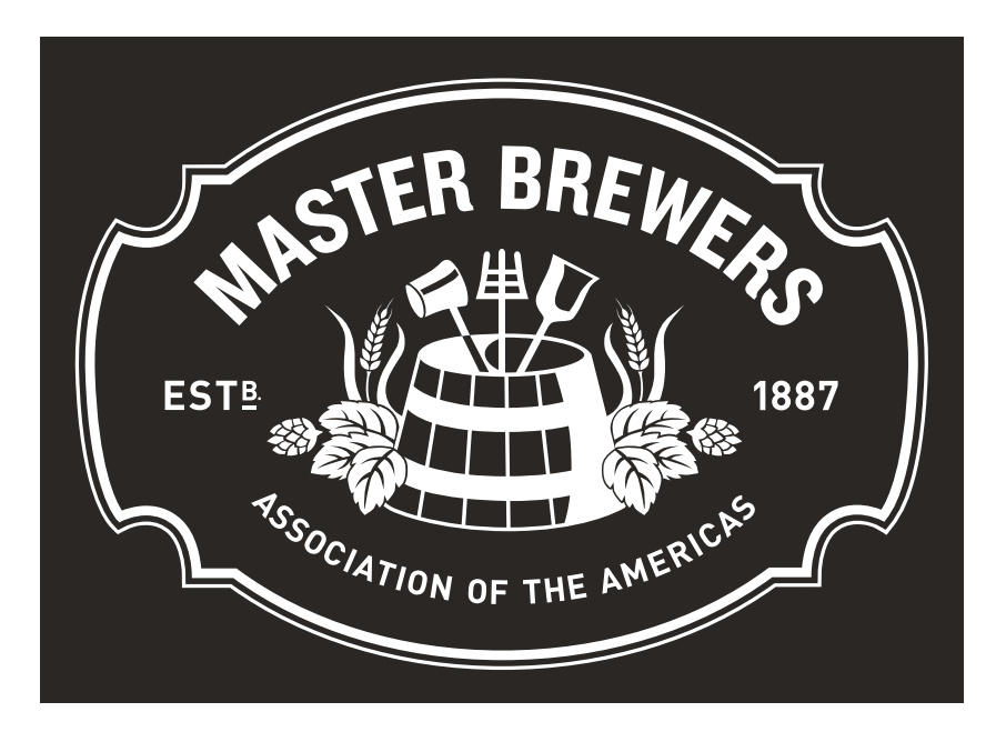
Logomark reversed in white