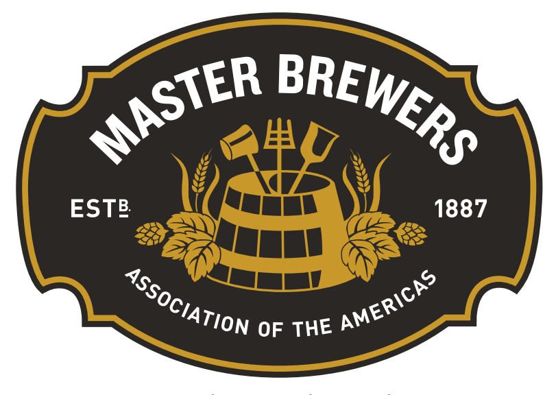
Logomark reversed in 2 color