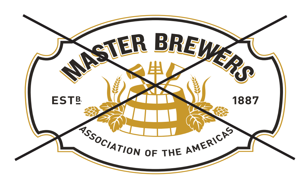
Never horizontally stretch the logomark