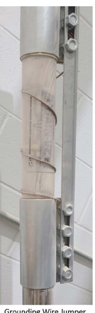
Grounding Wire Jumper

If using metal pipe with site glass to view flow movement, make sure that additional grounding is in place to continue the loop in your system.